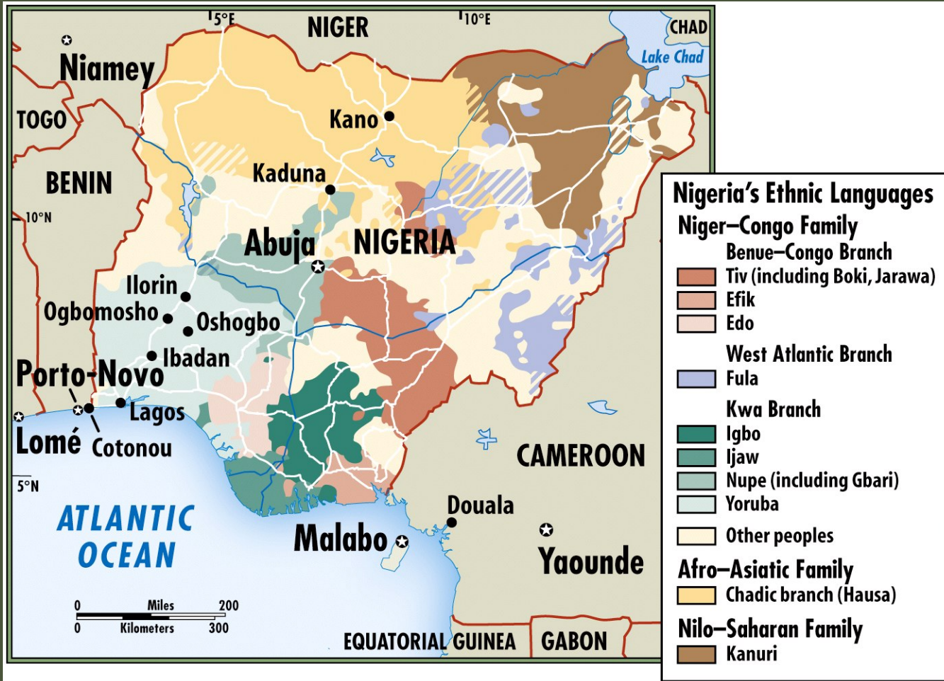
Figure 7-17 World Regional Geography, Third Edition