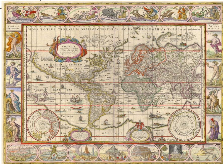
Theatrum orbis terrarum (1635)