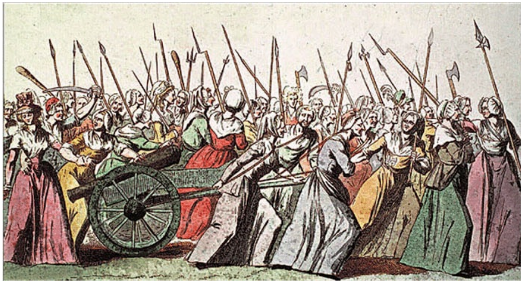
Engraving of the march of the market women on Versailles, October 5, 1789

Robert Tignor, et al., Worlds Together, Worlds Apart , vol. B, 600 to 1850, 4 th ed. (New York: W W Norton and Co, 2014) [TRS # 11.244]